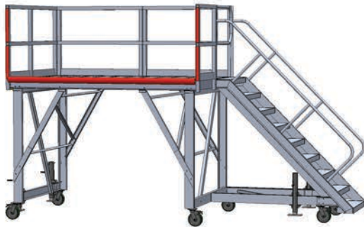
platform edge and guardrails