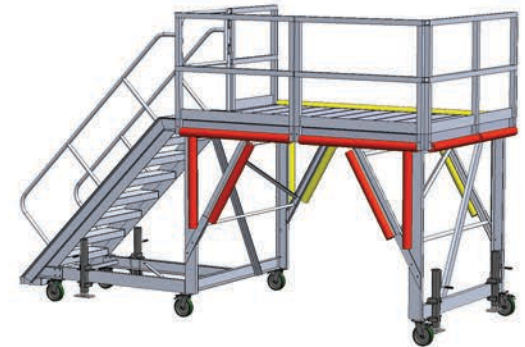
add legs and cross-beams on both sides and short ends

Please submit a completed form to design@safe-t-fab.com to request a proposal