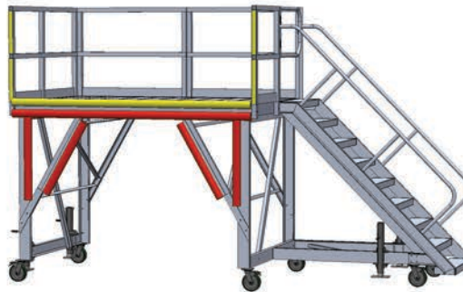
add legs and cross- beams on working side