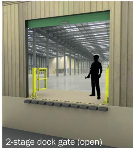
2-stage dock gate (open)