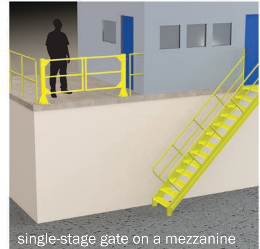
single-stage gate on a mezzanine

Please submit a completed form to design@safe-t-fab.com to request a proposal